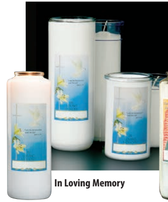
In Loving Memory