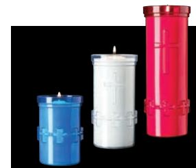
3-Day Blue 5-Day Clear 6-Day Ruby

Lightweight and disposable, Devotiona-Lites® are specially designed for a superior burn performance in an attractively embossed plastic container.